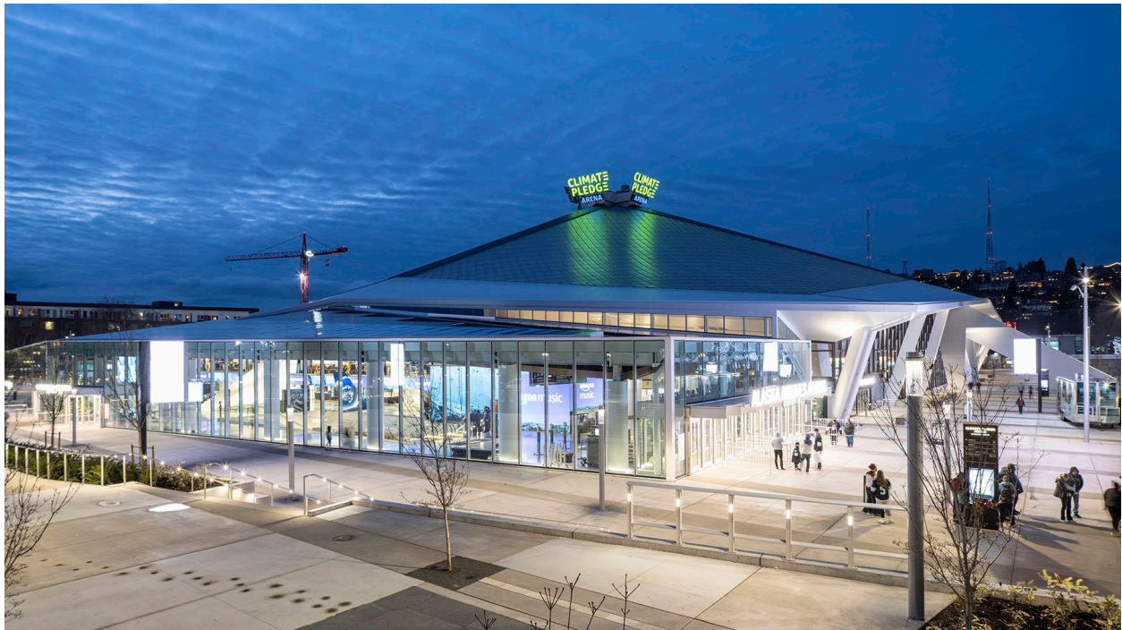
Climate Pledge Arena: 2023 OCEA Winner

This document is a compilation of frequently used information, updated annually.